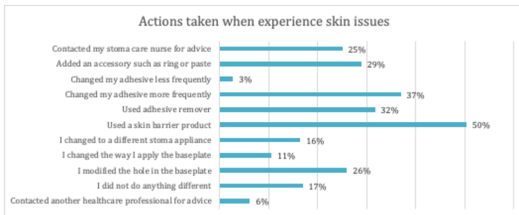
Figure text: Participants can take multiple actions when experiencing skin issues.